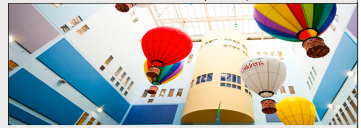
The atrium of Children's National – main hospital campus

Children's National is the pediatric teaching hospital for the George Washington University School of Medicine and Health Sciences. Psychologists at Children's National hold academic appointments in the Department of Psychiatry and Behavioral Sciences and the Department of Pediatrics at the medical school.