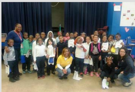
MedStar Family Choice with Payne ES students

MedStar Family Choice visited Payne Elementary School on March 13th to share with the first and second graders information on dental health. The presentation was interactive and the students were able to practice proper flossing and brushing techniques. They were also given goodie bags with toothbrushes, toothpaste, disposable picks for flossing and a timer to use when brushing their teeth.