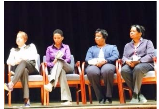
Womens History Month panel