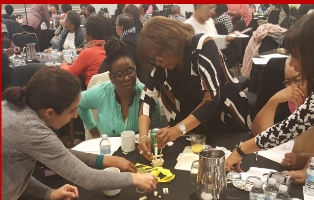
Nurses from Ward 3 working together to build their sail boat

Presentation and more photos have been posted to RNsConnect.