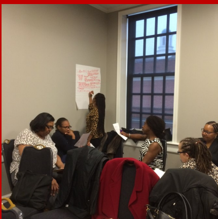
Nurses engaged in discussion during the Children with Special Healthcare Needs Breakout Session