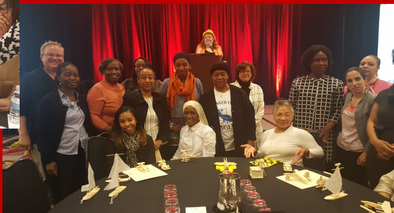
Children's National School Services Nurses showing off their crafty skills