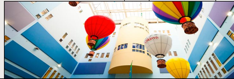
The atrium of Children's National – main hospital campus

Children's National is the pediatric teaching hospital for the George Washington University School of Medicine and Health Sciences. Psychologists at Children's National hold academic appointments in the Department of Psychiatry and Behavioral Sciences and the Department of Pediatrics at the medical school.